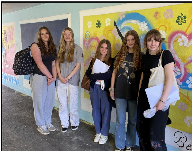
Students from St John's