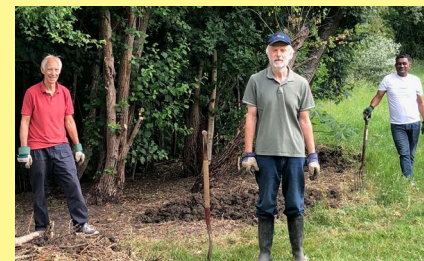
Volunteers at Westlea Park

West Swindon has many volunteers helping keep local green spaces clean and tidy. We paused this during the last few months however we are slowly starting again, taking into account extra steps to encourage our volunteers to stay safe. At Westlea Park, volunteers were recently out tidying and planting, planning for Spring next year. If you would like to do your bit on your own or as part of a group, check our website or please contact us. Cllr Simon Firth says "If you have an idea for a community or neighbourhood project please get in touch with the Parish office, we may be able to help".